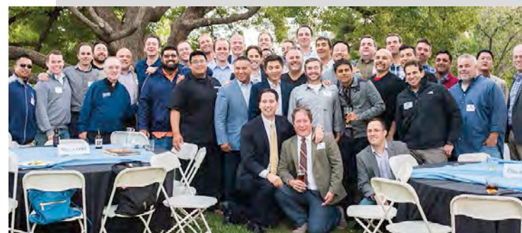
Grand Reunion 2015