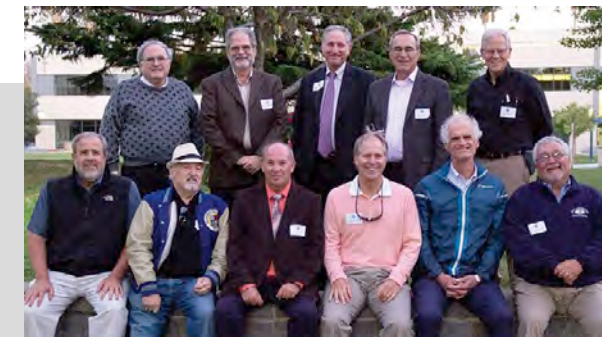
Grand Reunion 2015