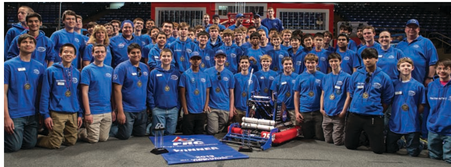
BCP Robotics Team 254 – The Cheesy Poofs celebrate their win at Silicon Valley Regional competition in April 2013.

Bellarmine College Preparatory's VEX Robotics Team 254D, "The Cheesy Poofs," claimed victory in the inaugural California State Championships. The competition was held March 15 and 16, 2013 at California's Great America Theme Park in Santa Clara.